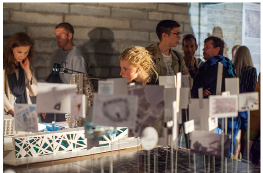
TAB 2013