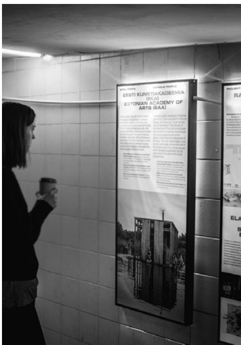
TAB 2017