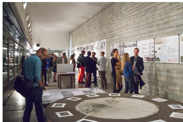
TAB 2013