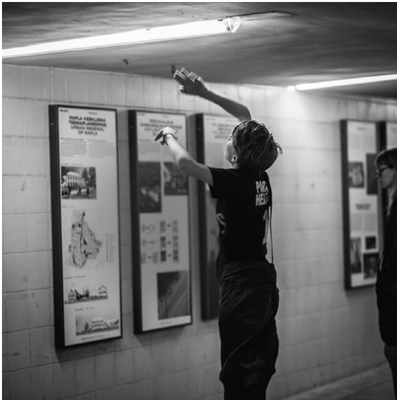
TAB 2017