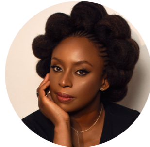
CHIMAMANDA NGOZI ADICHIE Award-winning writer and feminist