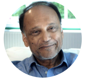
PARTHA DASGUPTA Emeritus Professor of Economics, University of Cambridge