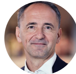
JIM HAGEMANN SNABE Chairman, Siemens, World Economic Forum Trustee