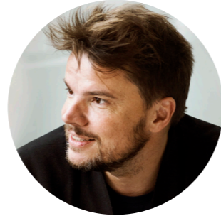
BJARKE INGELS Founder, BIG