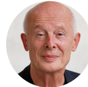
HANS JOACHIM SCHELLNHUBER Founder & Managing Director, Bauhaus Earth