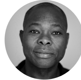
FRANCIS KÉRÉ Founder & Principal, Kéré Architecture, 2022 Pritzker Prize winner