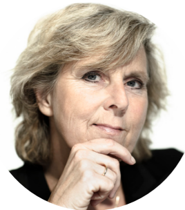
CONNIE HEDEGAARD Master of Ceremonies