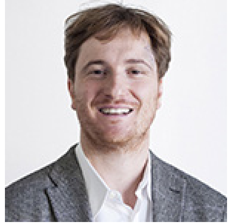
Agostino Ghirardelli SBGA Milano