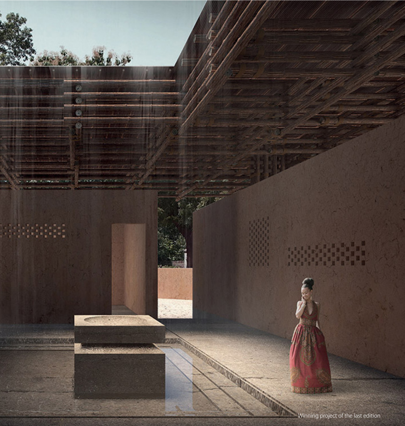
Winning project of the last edition