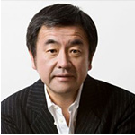
Kengo Kuma Kengo Kuma & Associates Tokyo, Paris, Beijing