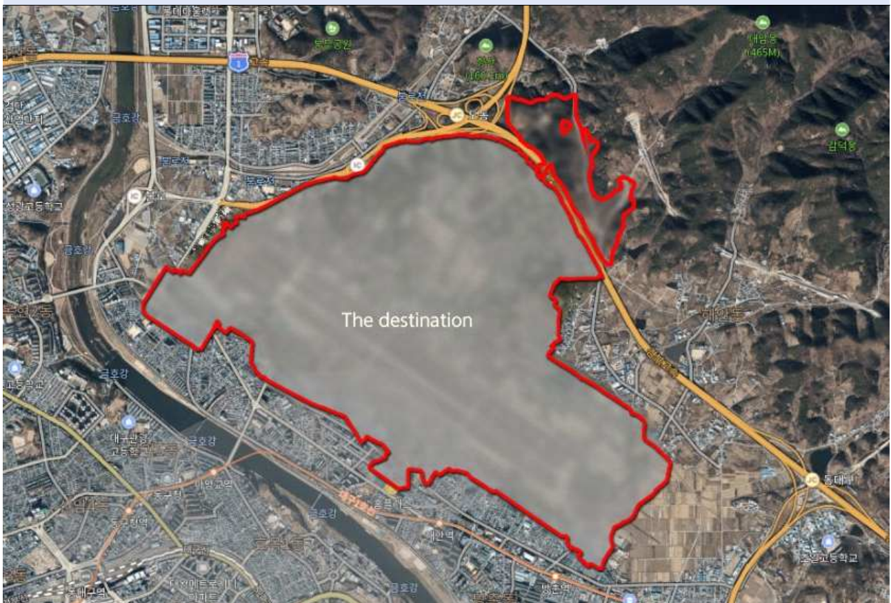
Aerial photos of the destination